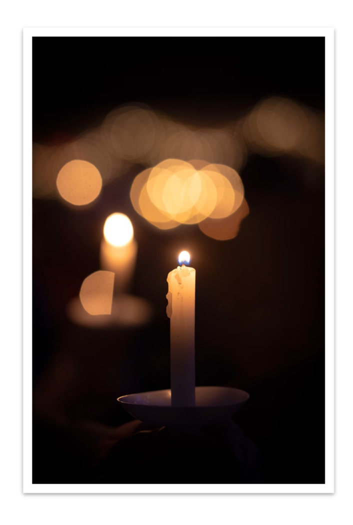
Maundy Thursday Service of Tenebrae March 28, 2024 7:00 PM